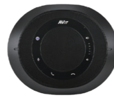
Microsoft Teams edition